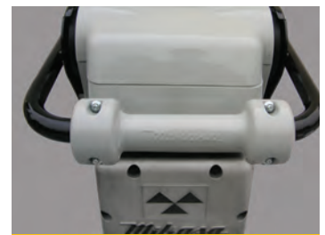
EASY LOAD HANDLE ROLLER