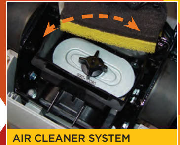
AIR CLEANER SYSTEM