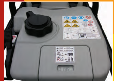
3-LITRE FUEL TANK