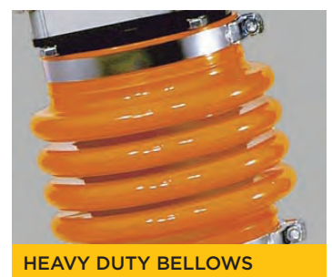
HEAVY DUTY BELLOWS