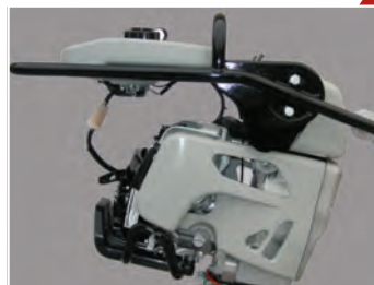
VAS ANTI-VIBRATION SYSTEM