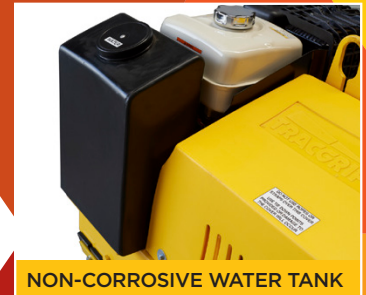
NON-CORROSIVE WATER TANK