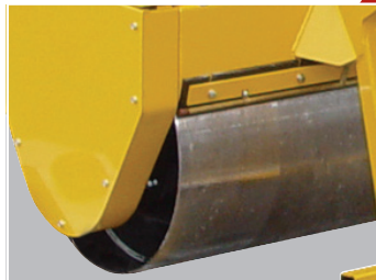
CHAMFERED ROLLER EDGE