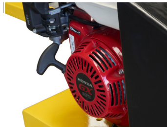
POWERED BY HONDA GX270