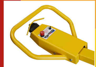
HANDLE CONTROL / DEAD MAN