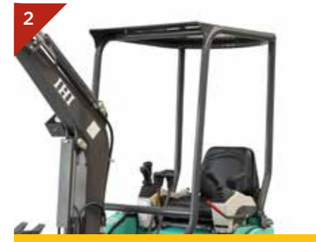
ROPS Canopy (Standard) - 4 Post ROPS canopy as standard

Expanding from 980mm to 1300mm with an auto lift dozer blade.