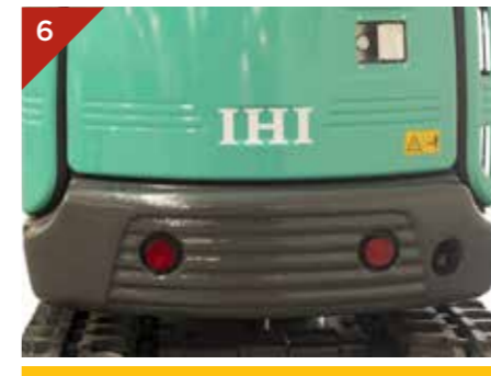
Removable counter weight