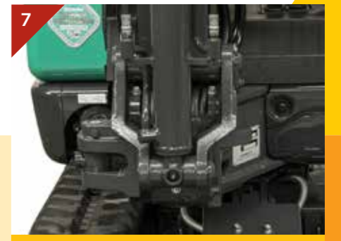
Offset boom - for increased visibility and boom rotation