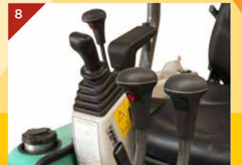
Two speed selection and track extension selection on joysticks

PROUD TO BE 100% NEW ZEALAND OWNED & OPERATED