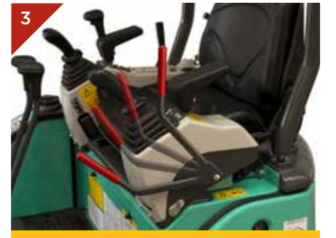
Gate lock system - Designed to lock all functions