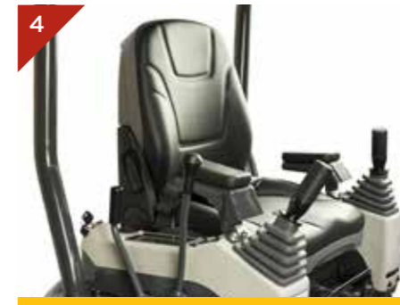
Comfortable operating room With 20% more leg room